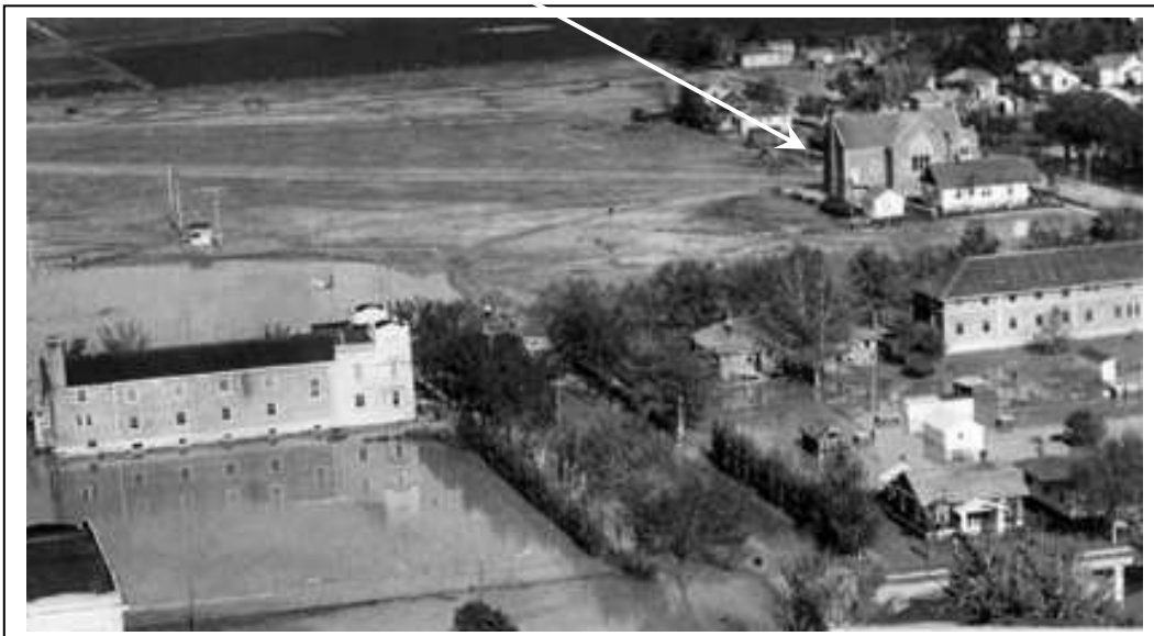
1935. Church seen in upper right hand corner. Image courtesy of Western History/Genealogy Department, Denver Public Library, Photo X-7256.

The church building occupies most of two lots, which measure 100 feet north-south by 90 feet east-west, at the northwest corner of Clifton and Everett Streets. The building is surrounded on all four sides by a well-cared-for planted grass lawn. A grass strip separates a concrete sidewalk from Clifton Street along the east property line, while the concrete sidewalk, along the south property line lies directly adjacent to Everett Street. Single-family homes are located north and west of the church. A gravel parking lot, utilized by the church's parishioners, is located across Everett Street to the south.