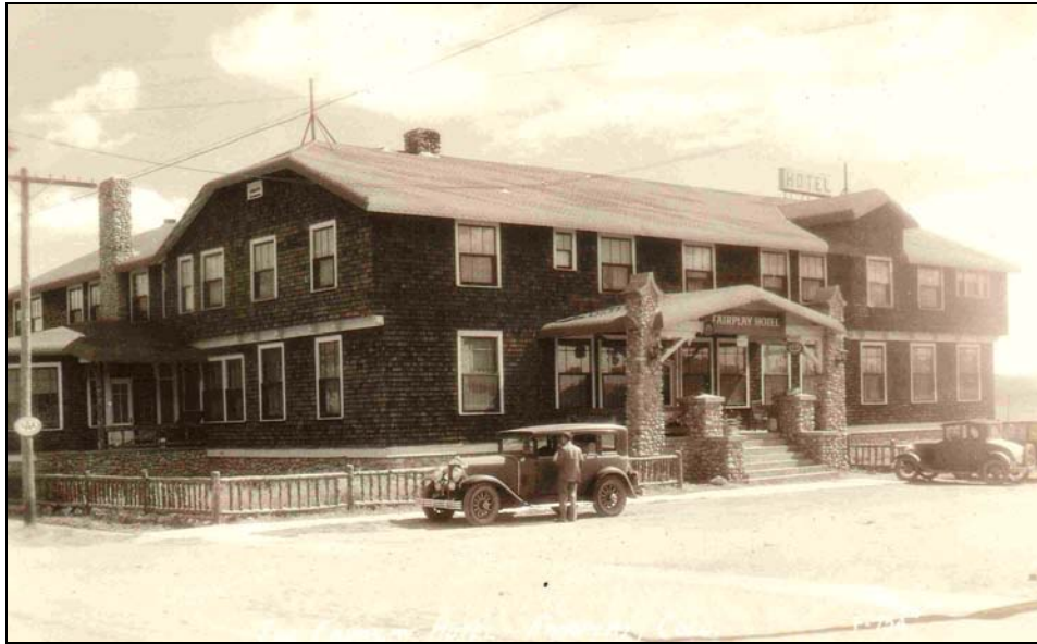
Figure 7. The hotel displayed the oval "AAA" medallions of the American Automobile Association, indicating that it was an approved accommodation of the motoring group. The image is estimated to date to the early 1930s.