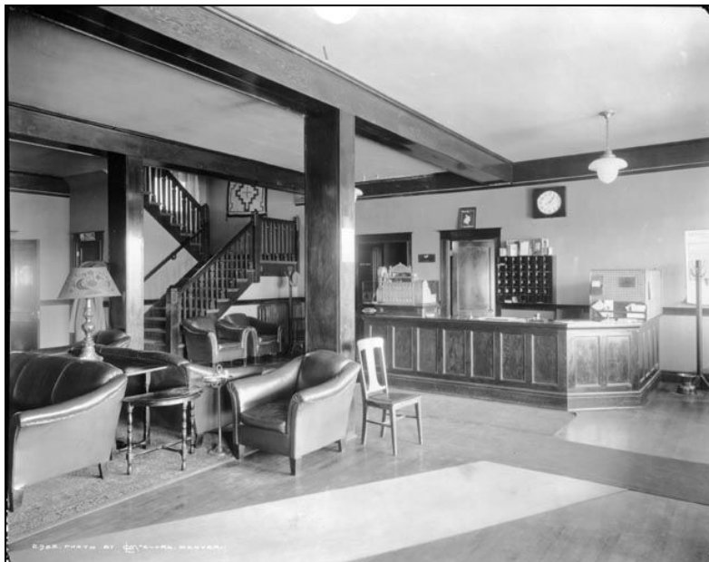
Figure 4. A portion of the lobby, the main stairs to the second story, and the registration desk (no longer extant) were captured in this mid-1920s view.