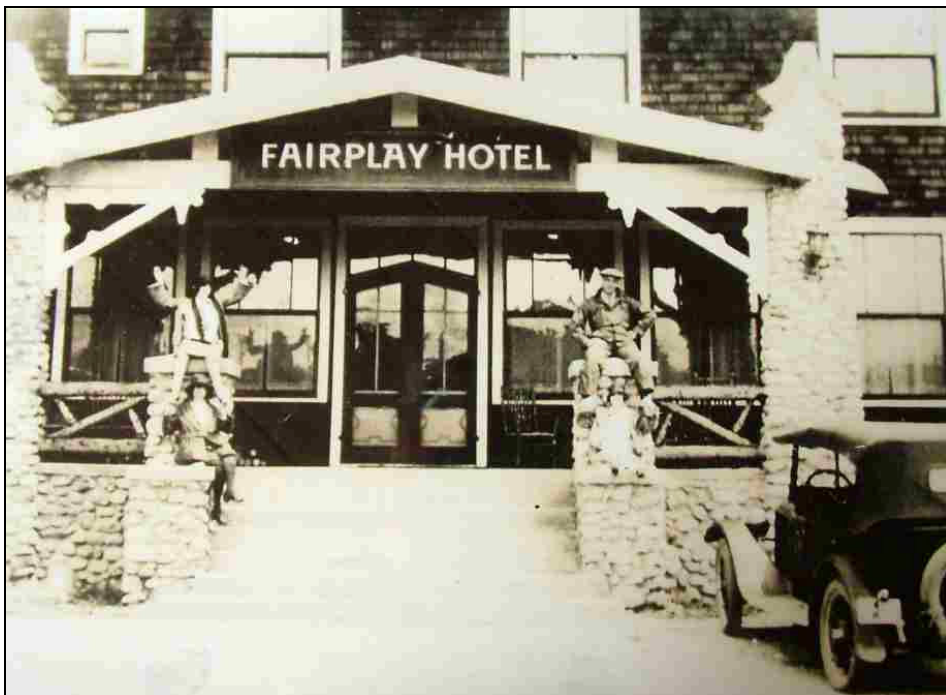
Figure 2. Four visitors to the Fairplay Hotel pose on the front porch in this 1920s view. The original front doors (shown here) are still present inside the vestibule.

The vestibule projecting on the porch was built after the mid-1960s, based on a historic postcard view. The fenestration of the original sunroom on the north was altered when the lounge was created after Prohibition in 1934. Redwood in the lounge was installed about 1949. The one-story addition to the sunroom on the north was built in 1984; the original open porch at the west end of the original sunroom was partially enclosed after the mid-1960s. Horizontal boards cover two window openings on the second story of the east wall of the east-west wing. Other alterations include remodeling of a window into a door on the south wall of the north-south wing and the addition of a metal fire escape. Some windows are boarded up. On the interior, the total number of guest rooms has been reduced, and some areas, such as the restrooms, have been remodeled.