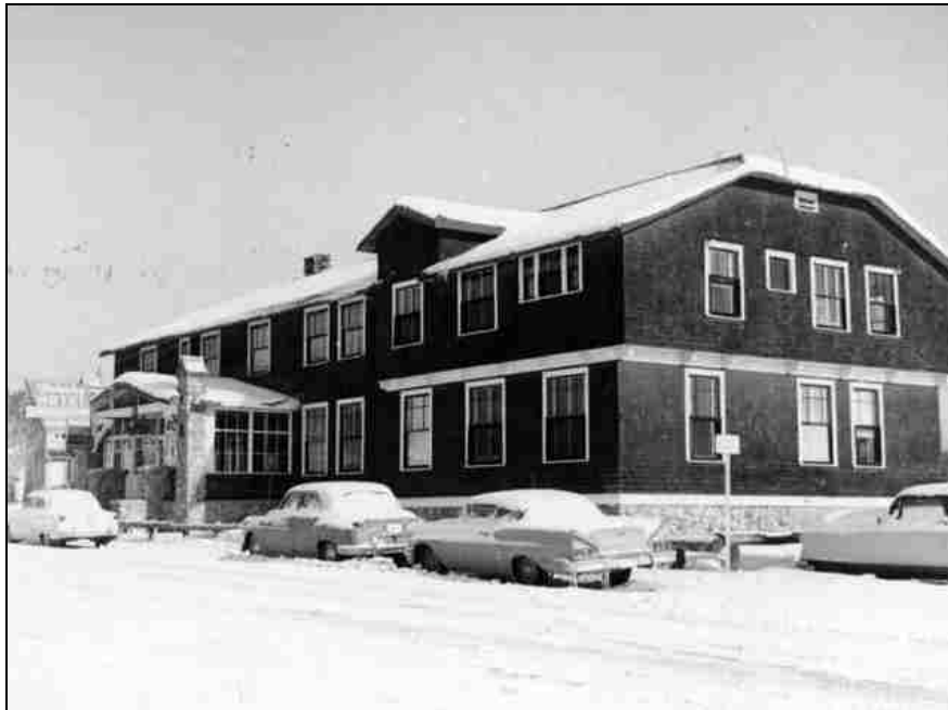
Figure 10. This late-1950s-early 1960s photograph of the hotel in winter shows the front and south end of the building before the current fire escape was installed.