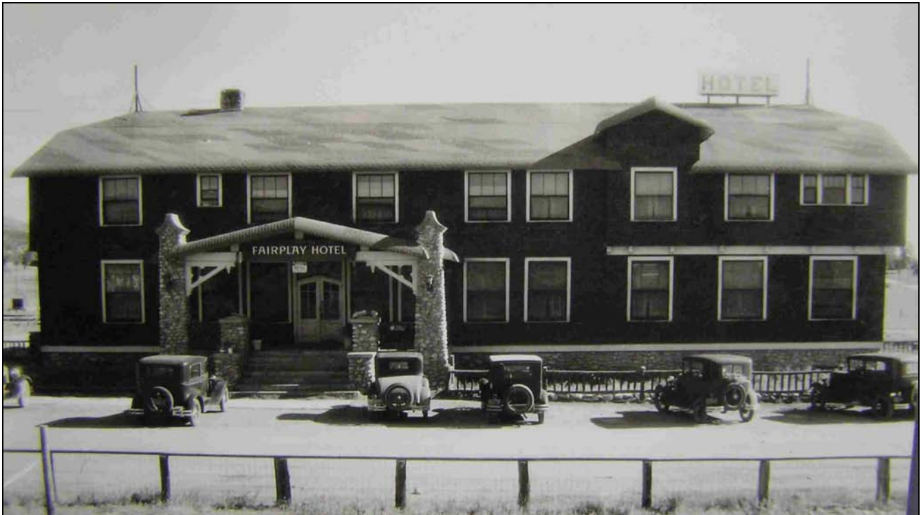
Figure 1. This circa early 1930s image presents a good view of the front of the hotel, with visitors' cars parked along the adjacent highway and with a tennis court (net and post at left) in the foreground, where the Park County Administration Building is now located.

The Fairplay Hotel is a two-story Rustic style building in the heart of Fairplay, a historic mining town in central Colorado, eighty-five miles southwest of Denver. Located in the high mountain valley known as South Park, Fairplay is the county seat of Park County. The 1922 hotel, designed by prominent Denver architect William N. Bowman, consists of a main north-south wing intersected at the north end by an east-west wing, creating an L shape. The building has walls clad with evenly coursed wood shingles above a plain board water table and a raised concrete and river rock foundation. The same stone is found on the piers and base of the single-story porch and the chimneys. The broad, clipped gable roof of the hotel has asphalt shingles laid in picturesque false thatch that curves over the eaves, as well as deep overhangs. Located immediately adjacent to State Highway 9 (Main Street) at the corner of 5 th Street and occupying three town lots, the hotel is a prominent landmark for travelers through the region. The National Register-listed 1874 Park County Courthouse occupies the block to the north, while the current county administration building lies across Main Street to the west. The exterior space partially enclosed by the rear wing is landscaped with grass and has small aspen trees along the western edge and a wood privacy fence on the east near the alley. A small grassy area at