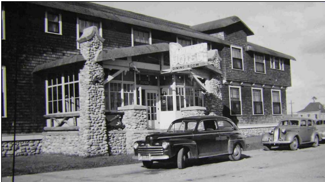
Figure 9. By the time this circa mid- to late-1940s photograph was taken, the front porch of the hotel had been enclosed. The porch remained enclosed through at least the mid-1960s.