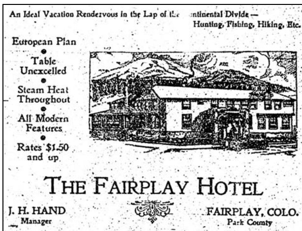
Figure 8. The hotel ran frequent display advertisements in the Fairplay Flume in the 1930s and early 1940s touting the amenities of the hostelry and its surroundings. SOURCE: Undated Fairplay Flume clipping in the files of the Park County Office of Historic Preservation.