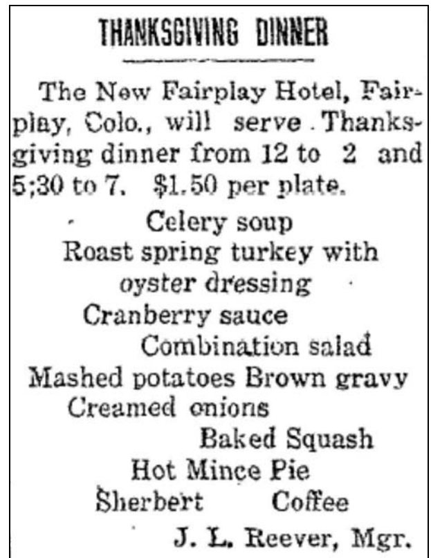
Figure 6. The Fairplay Hotel offered two seating times for a traditional Thanksgiving dinner in November 1923.