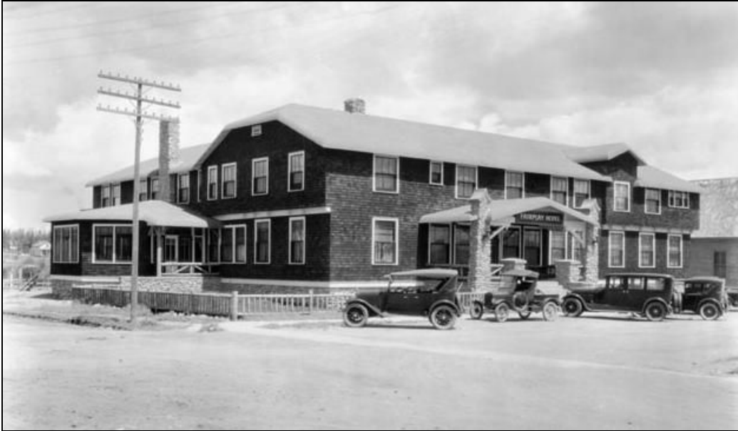
Figure 3. Denver photographer L.C. McClure documented the appearance of the hotel in these two images. The front and north wall of the building are shown in this photograph. Note the original configuration and fenestration of the one-story sunroom at the left.