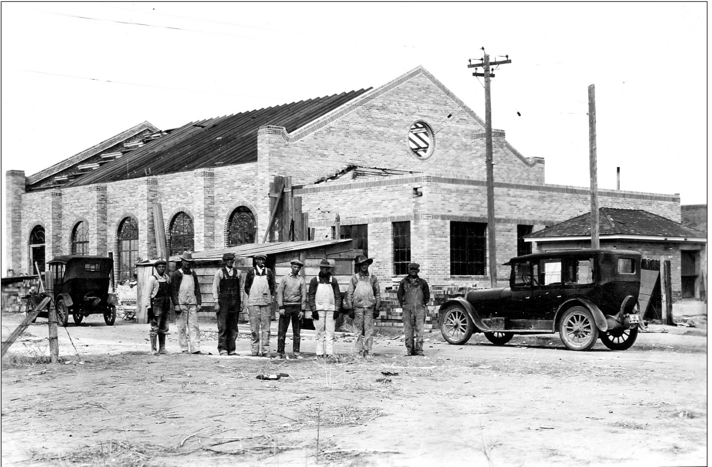
Figure 1. Workmen pose in front of the unfinished gymnasium in this ca. 1929 view northwest.