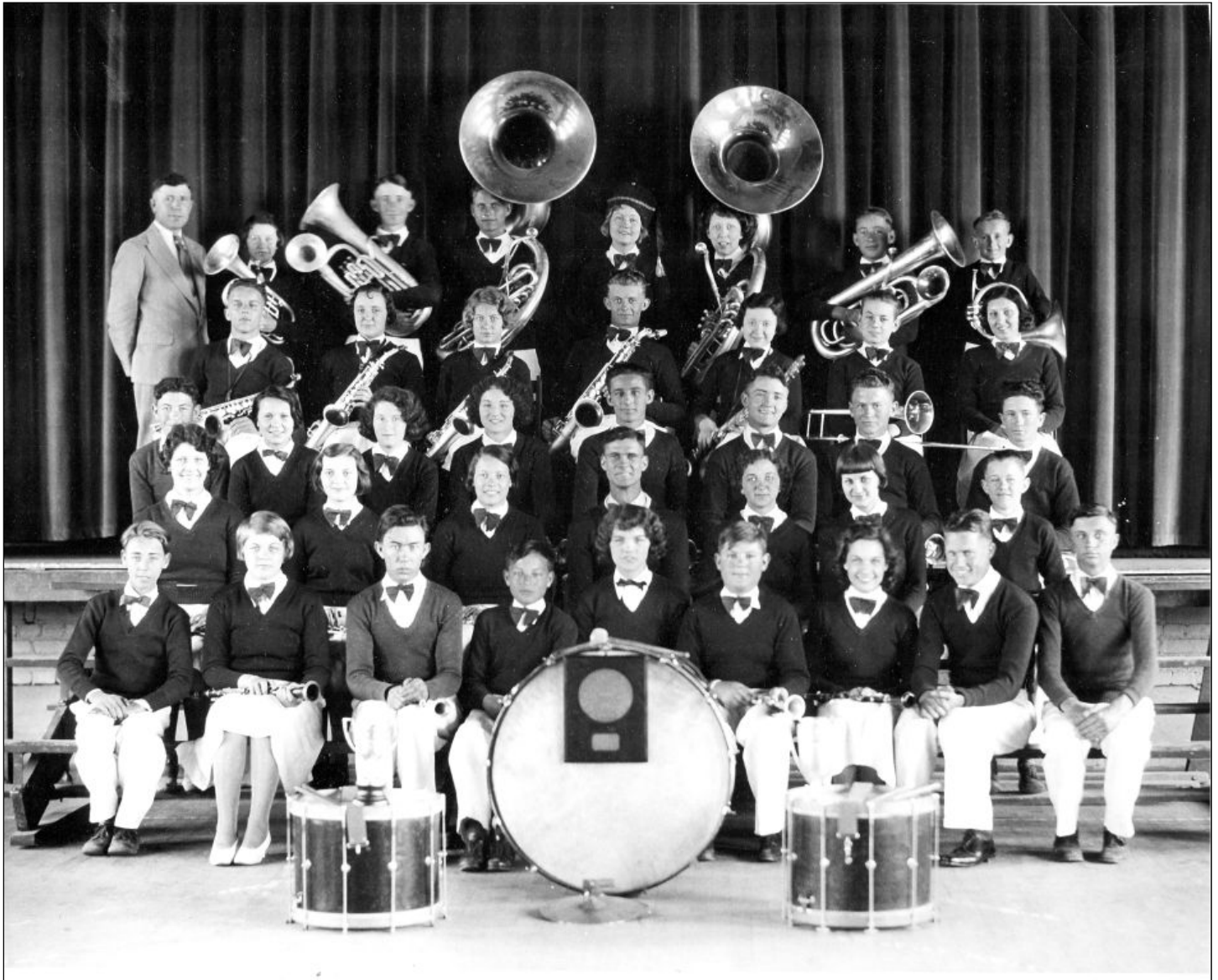
Figure 5. The Eads School band poses in front of the stage inside the gymnasium (view east).