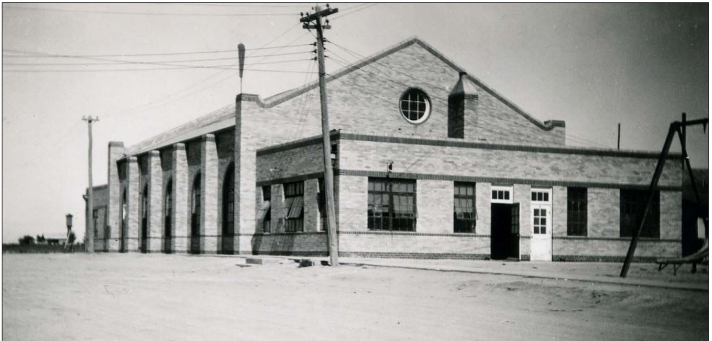
Figure 3. This view west-northwest from West 10 th Street provides another perspective on the completed gymnasium. Courtesy of Eads High School, photograph collection, Lewis collection, undated.