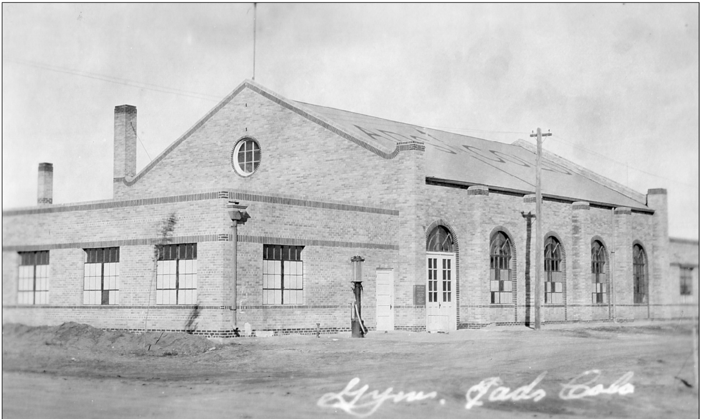
Figure 2. The finished gymnasium is shown in this early view northeast. Note the gasoline pump alongside the south wall and the "EADS COLO" with north arrow and windsock on the roof as aids to aviators.