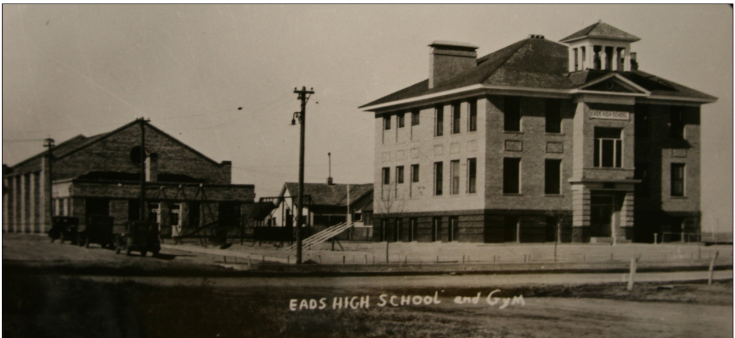
Figure 4. This pre-1937 view (northwest) from the intersection of Maine and 10 th streets illustrates the location of the gymnasium in relation to the old high school (right). Courtesy of Eads High School, photograph collection, undated.