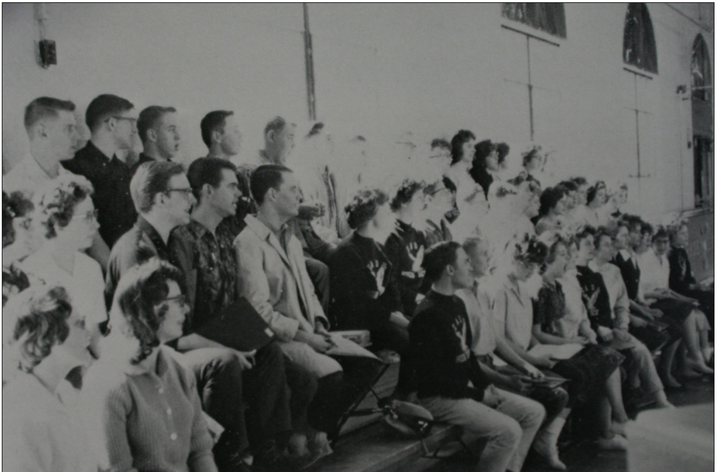
Figure 6. The Eads High School Mixed Chorus rehearses on bleachers inside the gymnasium (view west-southwest).