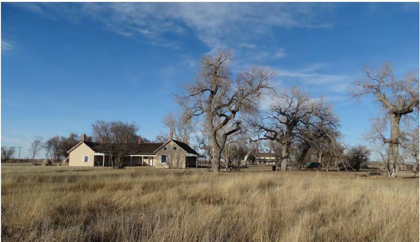
The Boggsville Historic Site.

grant will fund the next restoration phase of a multi-year project and create a long-term maintenance plan to protect the site for generations to come.