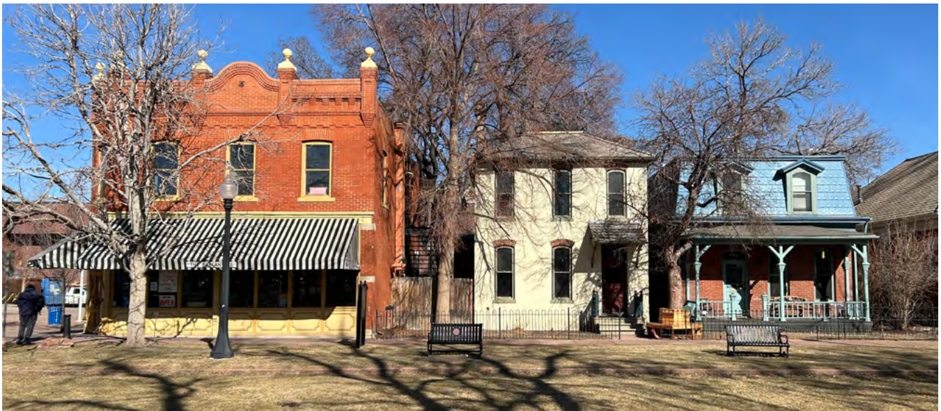
Three buildings, including a storefront, on the Northeast corner of the 9th Street Historic District in the City and County of Denver.