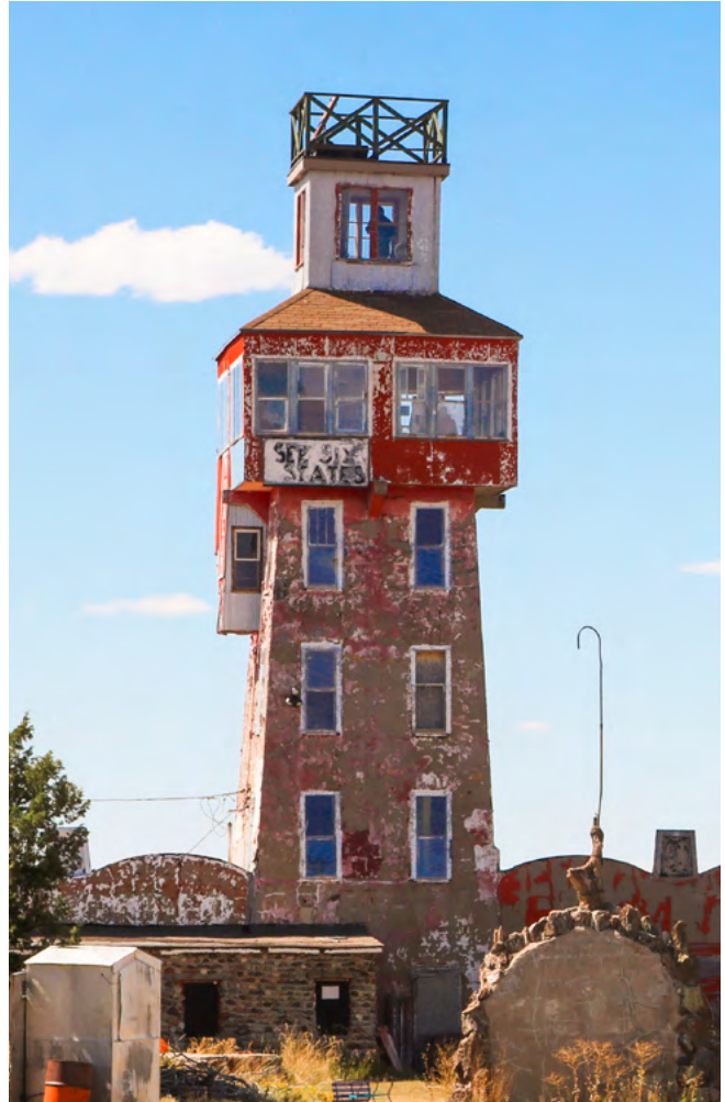
The World's Wonder View Tower.

The World's Wonder View Tower is an iconic landmark in Genoa, Colorado, built as a roadside attraction along US-24 in the 1920s. Throughout its history, the World's Wonder View Tower housed a diner, a gas station, a trading post, and other attractions for travelers. Boasting a height of 65 feet, the Tower's claim to fame is that it is possible to see six states - New Mexico, Kansas, Nebraska, Wyoming, South Dakota, and of course, Colorado - from the top of its tower. The Tower also served as a community gathering place, hosting school dances and celebrations, during its heyday. A previous State Historical Fund grant began the rehabilitation process, and this grant will focus on the main building, including work on the roof and exterior features that will bring the historic building one step closer to once again hosting visitors. Ultimately, this site will be the home to a visitor's center, museum, gift shop, community space, and housing for six artists in residence that will promote rural prosperity and economic development through heritage tourism.