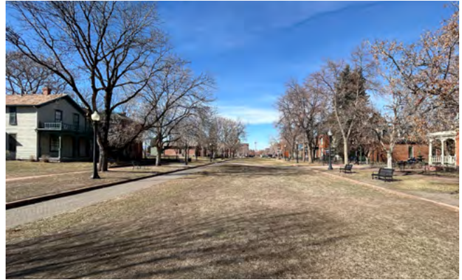
The 9th Street Historic District facing North towards the Auraria Campus.

The Auraria 9th Street Historic District, located on the campus of Metropolitan State University, Community College of Denver, and the University of Colorado, Denver, is the last residential block of the Auraria Neighborhood that was destroyed by Urban Renewal in the late 1960s and early 1970s. The Latino community, which called the neighborhood home since the 1920s, was displaced and forced to relocate. Now part of the Auraria Higher Education Center, the State Historical Fund grant will help complete Historic Structures Assessments for thirteen residential buildings and result in a robust preservation plan for the district. These residential buildings are home to student and campus organizations, non-profit groups, and gathering space for the displaced Aurarian community. With this comprehensive planning project, the Auraria Higher Education Center can plan out rehabilitation work and prioritize needs that will keep the district relevant and accessible. These efforts will allow the site to continue telling the story of the Auraria community.