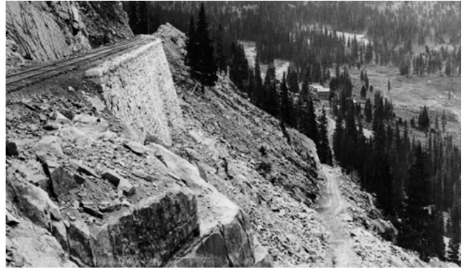
Palisade Wall after completion in the 1880s.

The National Forest Foundation and the United States Forest Service are utilizing a State Historical Fund grant to restore the Palisade Wall - an integral component of the high-altitude Alpine Tunnel in Gunnison County. Established in 1882, the tunnel was a section of the Denver, South Park, and Pacific Railroad, a remarkable engineering feat that connected Gunnison and Chaffee Counties by crossing the Continental Divide. In 1996, the 'Alpine Tunnel Historic District' was placed on the National Register of Historic Places, as North America's highest and longest narrow gauge railroad tunnel and the pioneer railroad tunnel to cross the Continental Divide. In 2016, an avalanche toppled a section of the wall, forcing the Forest Service to close the popular off-road