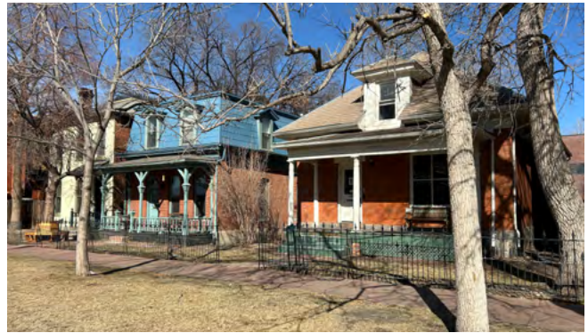
The 9th Street Historic District facing East toward the Auraria Campus.