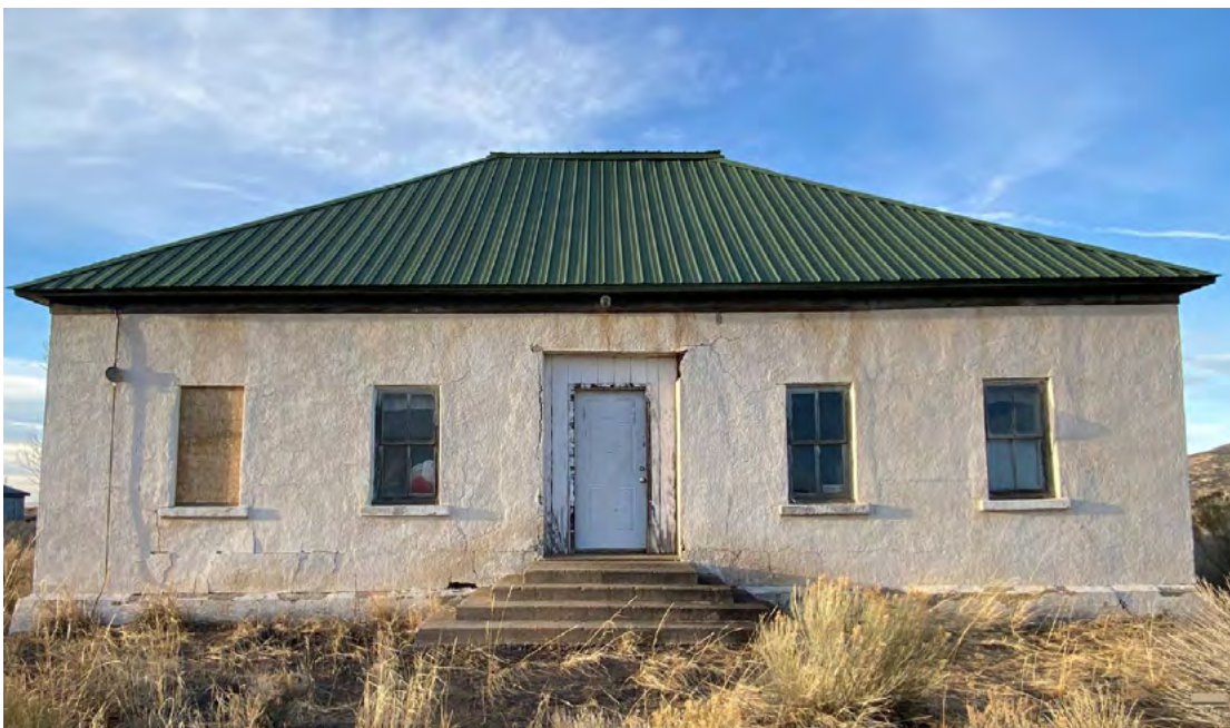
Garcia School, South Elevation.

Latino community in Costilla County, including learning opportunities and resources for both K-12 and adult education.