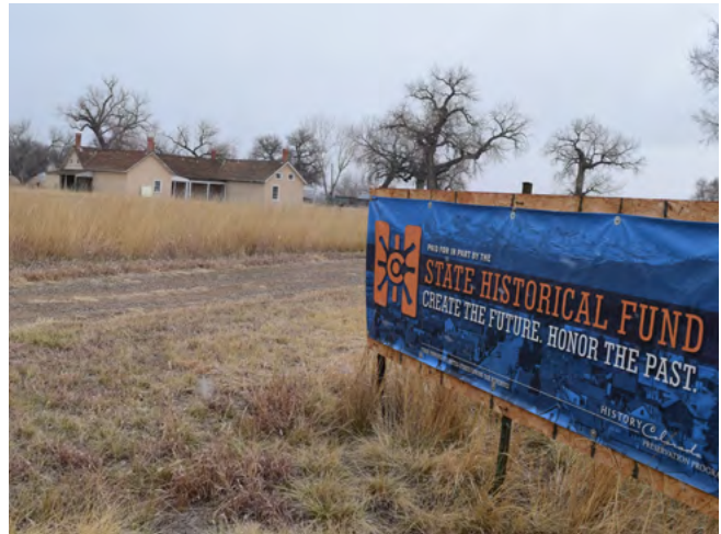
State Historical Fund signage outside Boggsville.