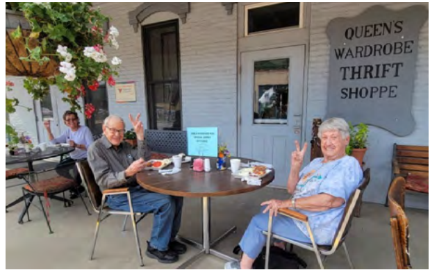
Project Support residents on the first story porch.

Located near the intersection of Miner Street and 14th Avenue in Idaho Springs, the Project Support Senior Center provides the only housing for low-income seniors in Clear Creek County. This building first appeared in historical records in the 1870s and was advertised as the Colorado Hotel as early as 1883. Today, the building provides 14 1-bedroom apartments for people over the age of 60 who qualify based on income, and it also houses a volunteer-run thrift shop that financially supports important local programs. The building is also home to Clear Creek County's Volunteers of America and Meals on Wheels program, which provides hot meals and transportation to residents. Volunteers of America has served over 2,000 meals using the building's dining room, while Meals on Wheels has delivered over 4,000 meals across the County. The State Historical Fund awarded Project