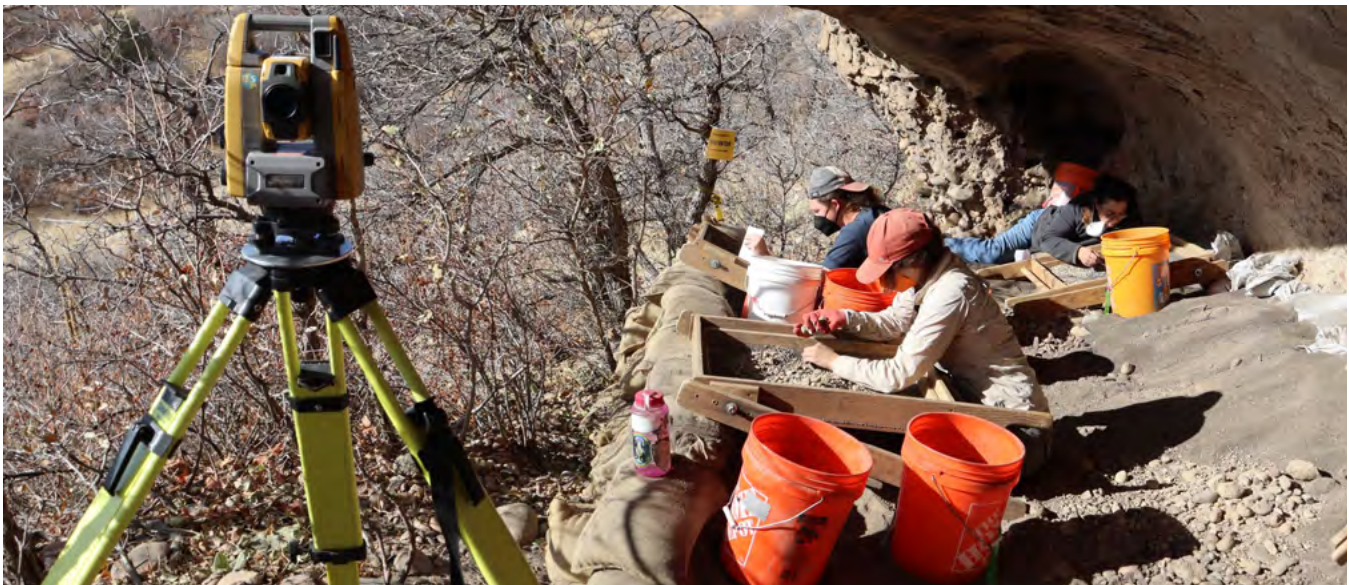
Site work underway.

artifacts from the ceramic period, beginning roughly 1800 years before the present, and transitioning into the historic period. The ceramics included locally produced wares, such as corrugated grey-ware sherd, but also a black-on-white painted biscuit ware sherd that may have been produced as far away as what is today the Upper Rio Grande Valley in northern New Mexico. The sherd reinforces that the pre-European contact past was incredibly dynamic, with Native Americans trading and interacting across vast distances. The State Historical Fund awarded Douglas County funding for the secondary excavation of the rock shelter. This phase will help the county manage its sensitive archaeological resources while planning for increased development and recreation in the foothills.