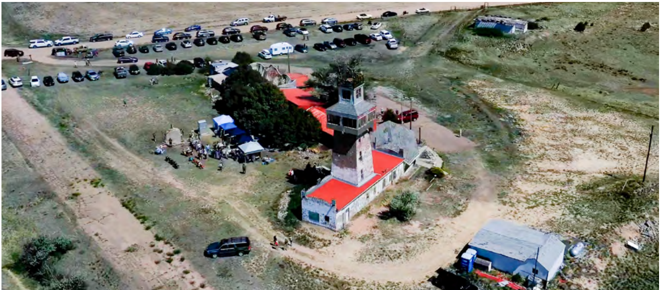
The World's Wonder View Site outside Genoa in Lincoln County, Colorado.