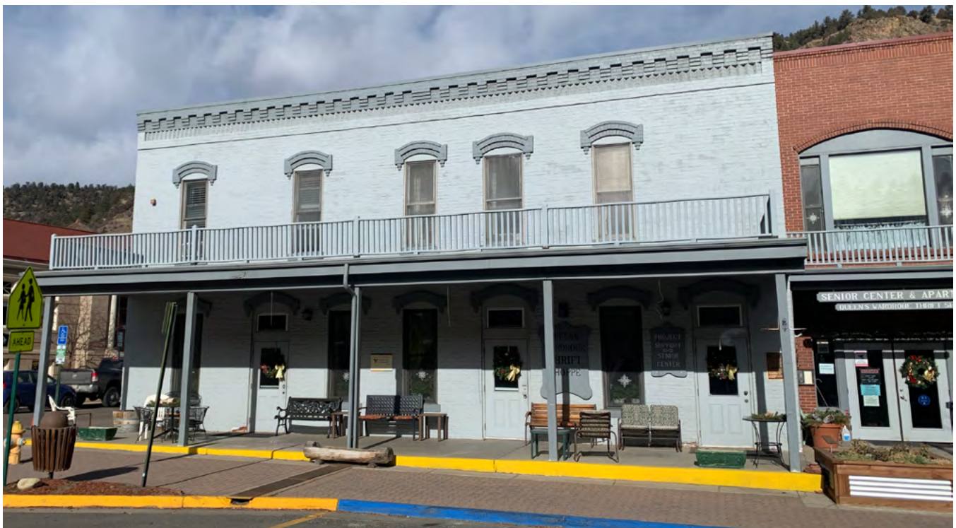
The Graeff Hotel in downtown Idaho Springs, Clear Creek County.

Support $14,065 to complete construction documents that will support future State Historical Fund grant applications, guide future exterior rehabilitation work, and keep the building active in the community.