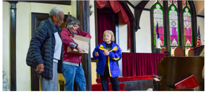
Members of the Manzanola Church at the bi-weekly food bank.

Established in 1893, Manzanola United Methodist Church in Colorado holds profound significance as it relates to African American communities in the state, especially to the agricultural homesteading settlement south of Manzanola known as “The Dry”. Families started moving into “The Dry” in 1915, and the church quickly became the heart of the community. It hosted community events and vacation bible schools along with holding regular services. Though many families left during the Dust Bowl and Great Depression, some returned in the 1960s and carried on the Church’s legacy. Today, the Church remains a haven for a dedicated