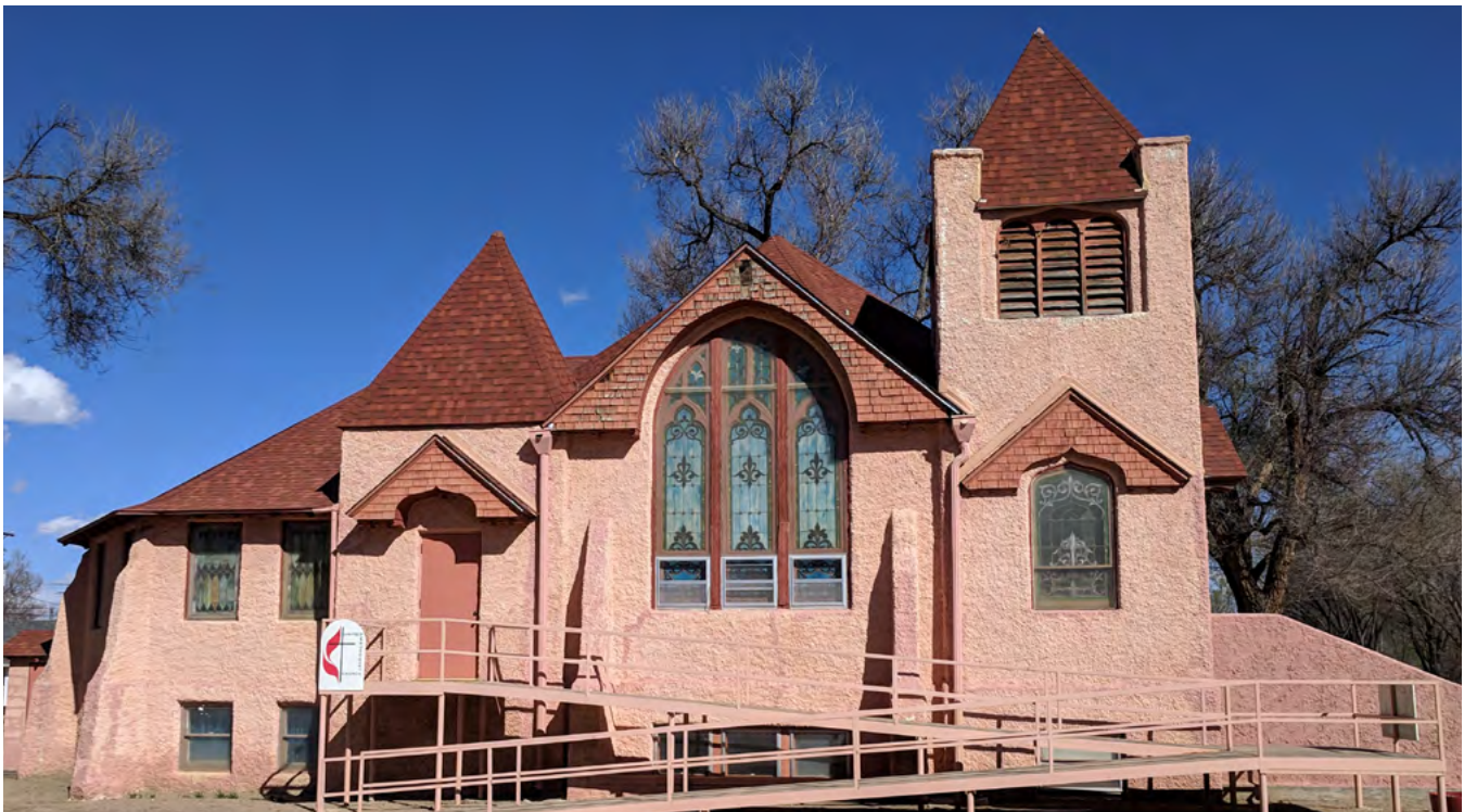
Manzanola United Methodist Church in Otero County.

congregation committed to preserving one of the last vestiges associated with “The Dry” and Black homesteaders in the region. The Church continues to be an important presence in the community, organizing and hosting several programs in the building, including the County’s Women/Infants/Children Program, Cub Scouts, holiday events, community emergency shelter, and bi-weekly community food bank. This grant provides funding for the creation of construction documents, along with exterior rehabilitation focusing on the roof and select exterior wood features.