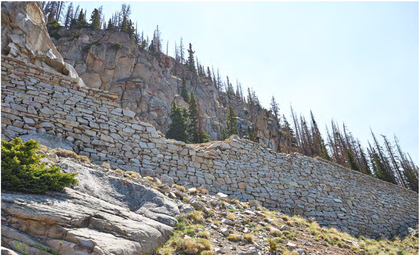
The collapse at the Palisade Wall in Gunnison County.

vehicle trail. This State Historical Fund grant supports a multi-year effort by the Forest Service to stabilize and reconstruct the damaged section, which will reinstate access for visitors to this popular destination. It will also contribute to economic development efforts of the Town of Pitkin and Gunnison County through vibrant and sustainable tourism.