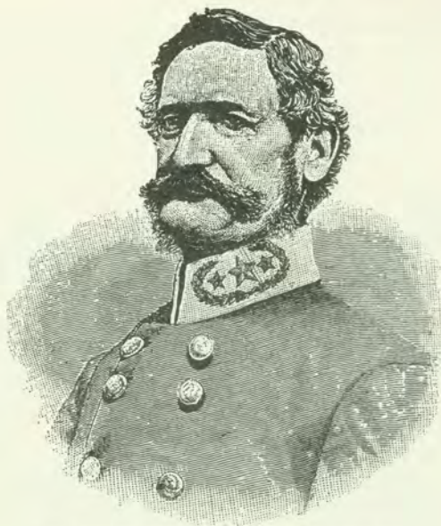
GENERAL HENRY HOPKINS SIBLEY

He was born in Louisiana in July, 1816, and in company with many other Southern gentlemen the army was to be his career.