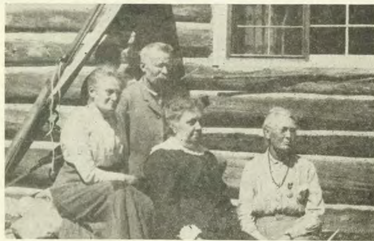
EDUCATION PIONEERS IN LARIMER COUNTY