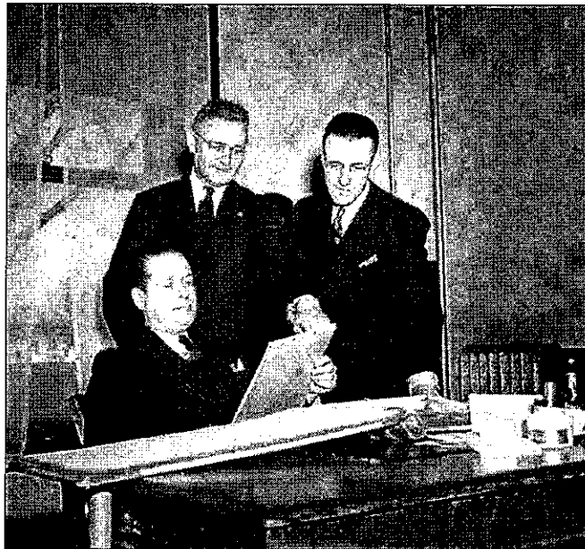
A well-framed motion is clear and easy for all to understand.

By presenting a clear and concise motion based on your community's design guidelines, you are better able to inform the public as to why you are approving, approving with conditions or denying a Certificate of Appropriateness and avoid misunderstandings and ill-feelings towards the commission and your community's preservation agenda.