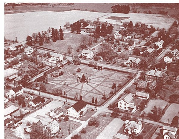
Zoar Historic District, Ohio. Aerial view.

Site: habitation sites, funerary sites, rock shelters, village sites, hunting and fishing sites, ceremonial sites, petroglyphs, rock carvings, ruins, gardens, grounds, battlefields, campsites, sites of treaty signings, trails, areas of land, shipwrecks, cemeteries, designed landscapes, and natural features, such as springs and rock formations, and land areas having cultural significance.