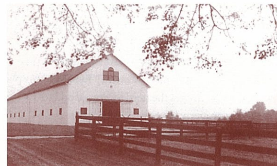
Elmendorf, Lexington, Kentucky.

Structure: bridges, tunnels, gold dredges, firetowers, canals, turbines, dams, power plants, corn-cribs, silos, roadways, shot towers, windmills, grain elevators, kilns, mounds, cairns, palisade fortifications, earthworks, railroad grades, systems of roadways and paths, boats and ships, railroad locomotives and cars, telescopes, carousels, bandstands, gazebos, and aircraft.