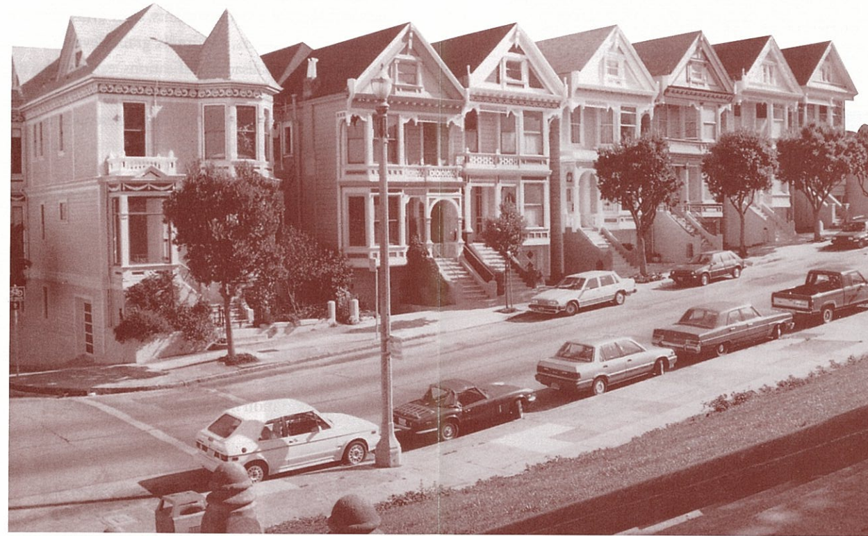
Alamo Square Historic District, San Francisco, California.

In summary, the simplification and sharpened focus of these revised sets of treatment Standards is intended to assist users in making sound historic preservation decisions. Choosing an appropriate treatment for a historic property, whether preservation, rehabilitation, restoration, or reconstruction is critical. This choice always depends on a variety of factors, including the property's historical significance, physical condition, proposed use, and intended interpretation.